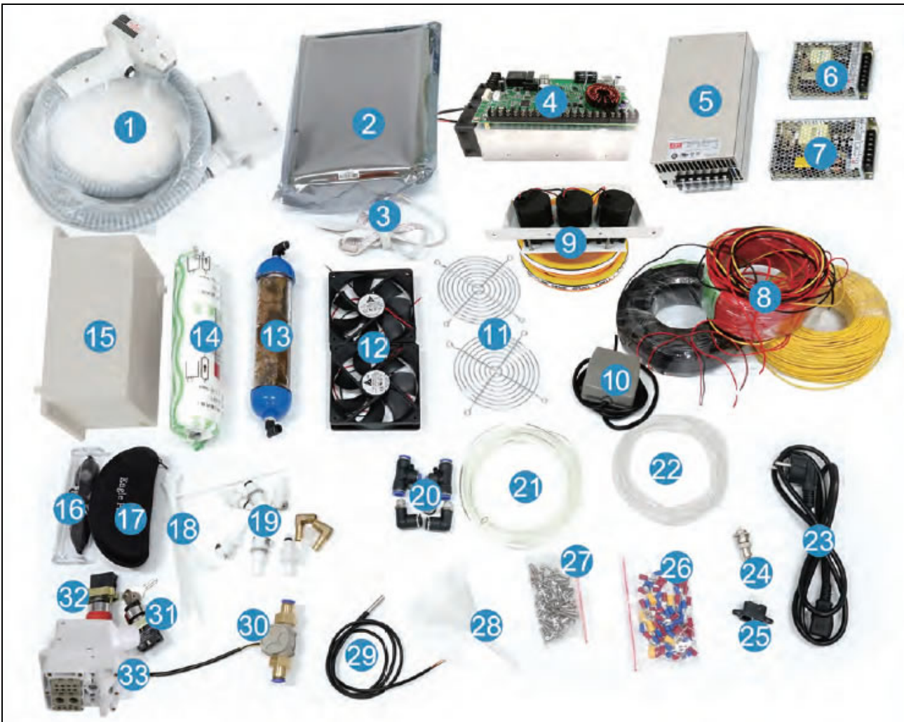
1. Micro channel diode laser handle 755nm/810nm/1064nm; 10.4inch color touch screen; 3. Screen cable; 4. Control board; 5. Power supply for laser bar; 6. Power supply for control board and Peltier; 7. Power supply for pump; 8. Electrical wire; 9. 3 water DC brushless pump; 10. Foot pedal switch 11. Fan cover 12. Electric fan; 13. Ion-exchange water filter; 14. PP filter; 15. Tank; 16. Protective glasses goggles; 17. Glasses; 18. Cable tie; 19. Hose barb water valve; 20. Water pipe adapter; 21. Hose; 22. Transparent hose; 23. Power cable; 24. Pedal connector; 25. Power interface; 26. U type pre-insulated connecting terminal; 27. Screw; 28. Water funnel; 29. Water temperature sensor; 30. Water flow sensor; 31. Key switch; 32. Self-lock emergency stop switch; 33. Handle connector.